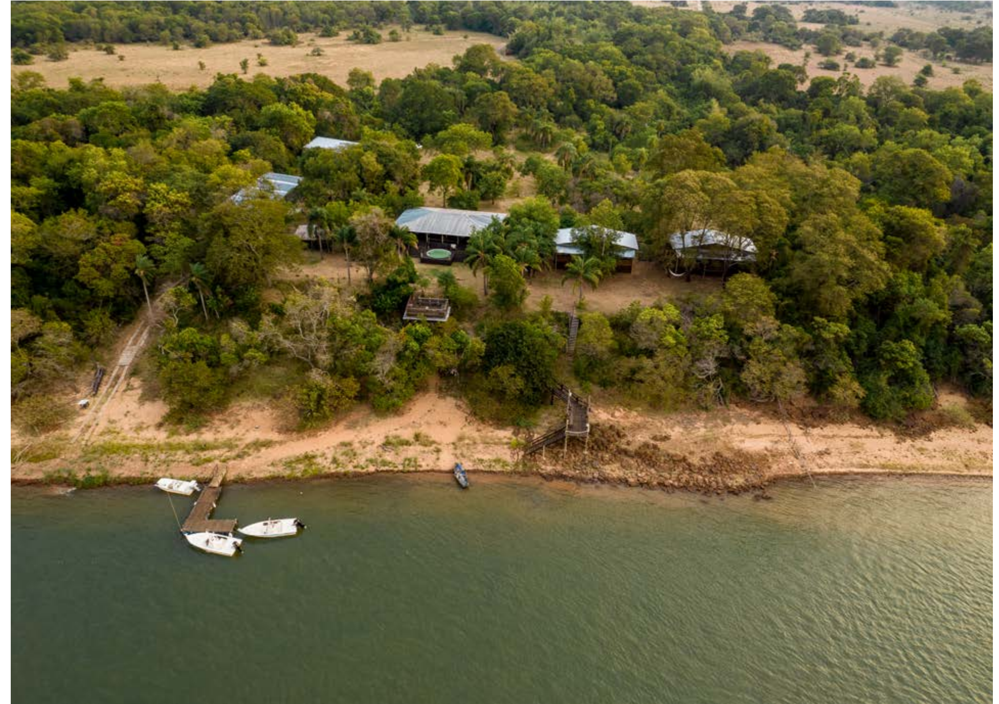
Suindá Lodge sits high on the riverbank of the clear upper part of the Paraná River.