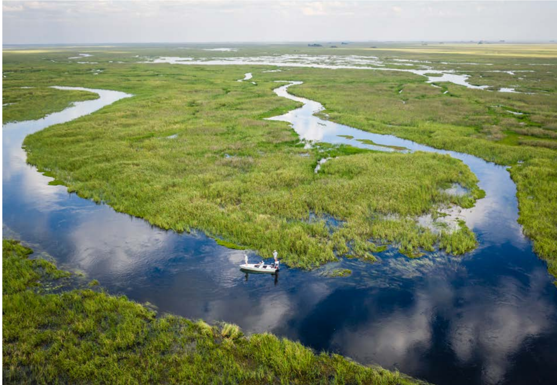
Dorado fishing at Pirá takes place in one of the planet's largest ecological preserve. The marsh "floating grass" islands are always shifting and moving, making the marsh truly alive and dynamic.