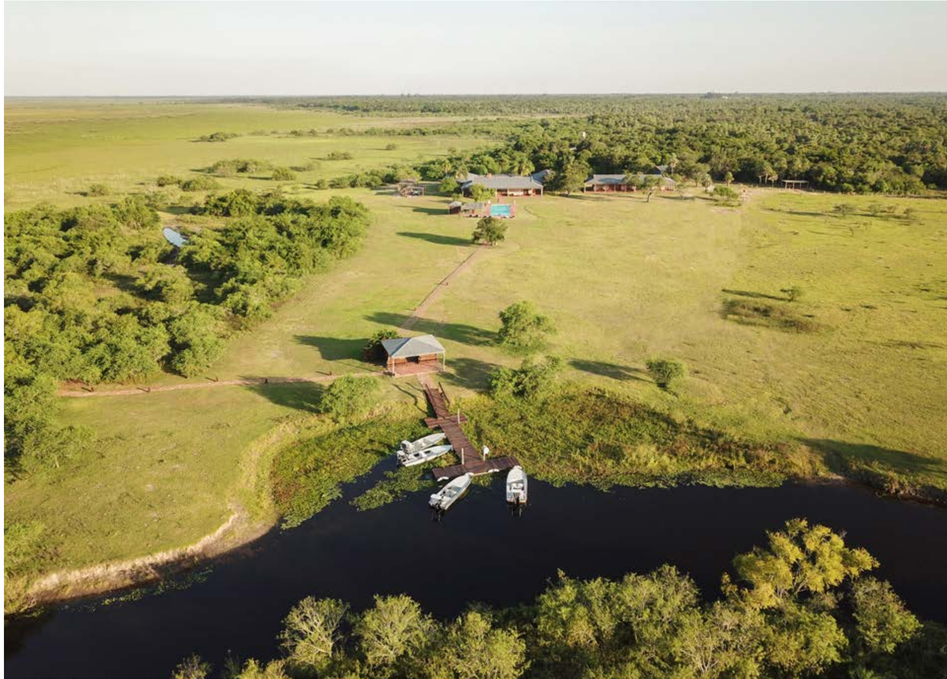
Pirá Lodge is strategically located in the heart of the 1,3 million hectare Iberá Marshland Nature Reserve.