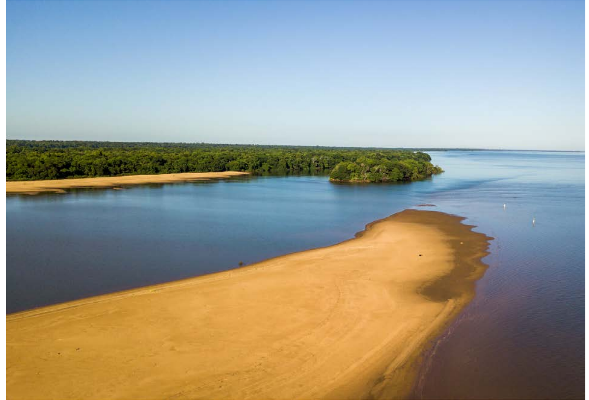
The sandbars are where the true excitement lies. When the conditions are right, colossal dorado hunt sabalo baitfish that seasonally congregate in big schools, resulting in massive boiling feeding frenzies in knee-deep water.